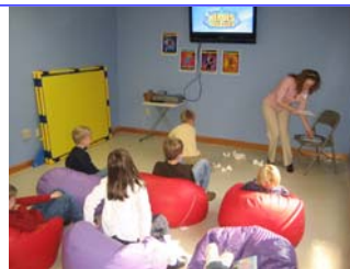
New Elevate Class for Kids