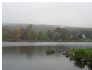
Fall leaves will be at their peak in a couple of weeks!