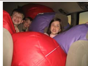
The day we bought new beanbags for the Children's classes - 12 beanbags and 3 kids really don't fit well in a minivan!!

The kiddos are already driving us crazy asking when the snow will start again! Apparently that is the only reason we moved up here! The boys have started playing soccer and we enrolled Abigail into gymnastics. They are loving their new activities. The big news this month is that we rearranged the rooms upstairs and they all have their own separate rooms again. There is peace in the household once again! We decided we could not survive another winter piled on top of each other! They are all three working hard on Christmas lists thanks to Mr. Chris—who updates us all daily on how many days we have left until Christmas!! They would probably put up the tree tomorrow if we would let them!